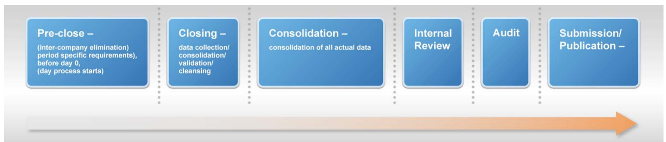
Figure 1. BusinessObjects The Close supports an end-to-end close process from source to digital disclosure.